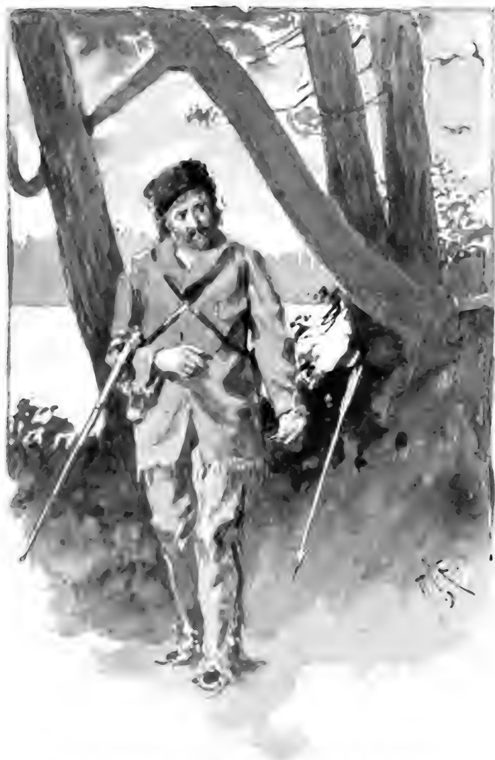
"AN ARROW SLIGHTLY STOKES HIS HAND,"—Page 172.